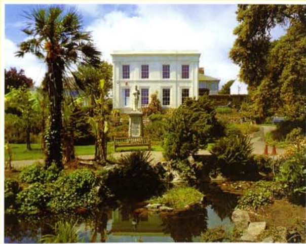
The Library viewed from Morrab Gardens

The Librarian, Morrab Library, Morrab Gardens, Penzance, Cornwall TR18 4DA.